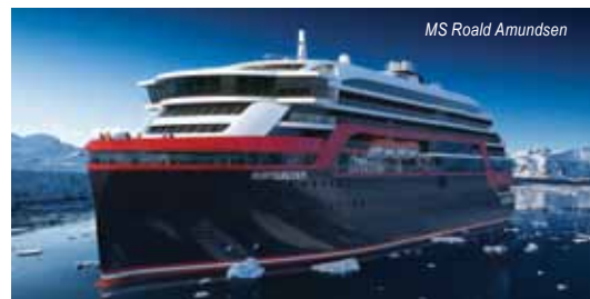
MS Roald Amundsen

Launching in May 2019 and featuring new environmentally sustainable hybrid technology, MS Roald Amundsen , Hurtigruten's newest ship, will serve as a comfortable basecamp at sea – bringing adventurers from all over the world to the most spectacular destinations in the most sustainable way. Enjoy the two-level Observation Deck, discover more in the Amundsen Science Center and mingle with the guests and crew in the Explorer Lounge, all relaxed and stylish spaces on board this state-of-the-art vessel.