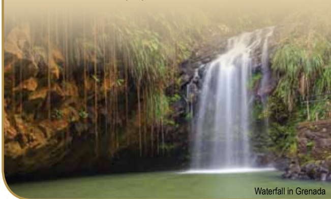
Waterfall in Grenada

In Antigua, take the wonderful opportunity to swim and snorkel with magnificent stingrays in their natural environment. See the graceful creatures glide through the clear waters; the resident rays are quite used to people in their environment.