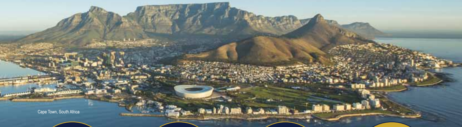
Cape Town, South Africa