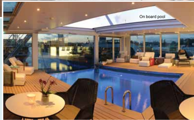
On board pool