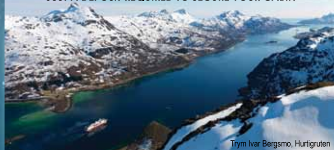
Trym Ivar Bergsmo, Hurtigruten

JUST A DEPOSIT REQUIRED TO SECURE YOUR CABIN