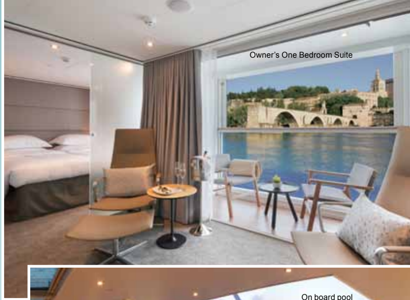
Owner's One Bedroom Suite

While other operators offer a French Balcony, Emerald Waterways bring the outdoors in with their Balcony Suites. At the touch of a button, their innovative open-air system's window drops down to let the air in and unveil full panoramic views.