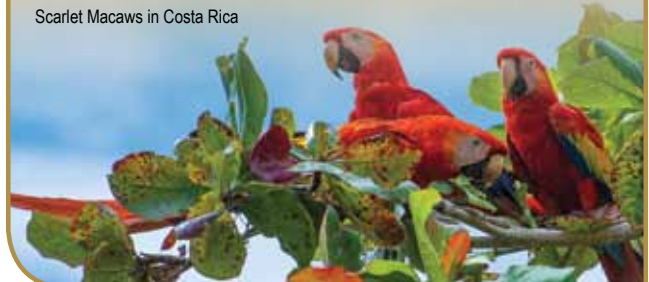
Scarlet Macaws in Costa Rica

Booking conditions of P&O Cruises (ATOL 6294) and Reader Offers Limited Agency terms of business apply. Please see back page for full terms and conditions.