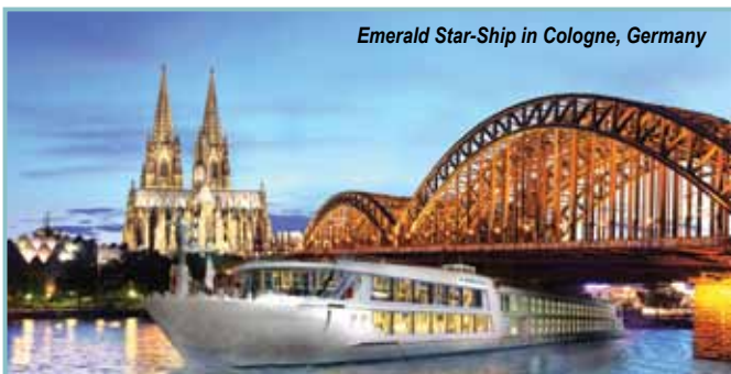
Emerald Star-Ship in Cologne, Germany